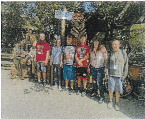
Indianapolis Zoo October 2024