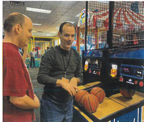
Playing games at Chuck E. Cheese