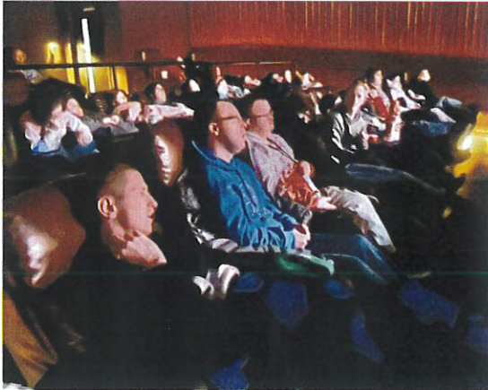
Sonic the Hedgehog 3 Movie