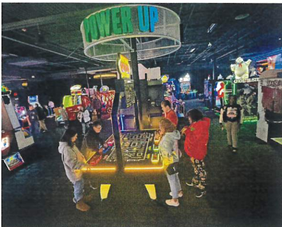
Dave and Busters