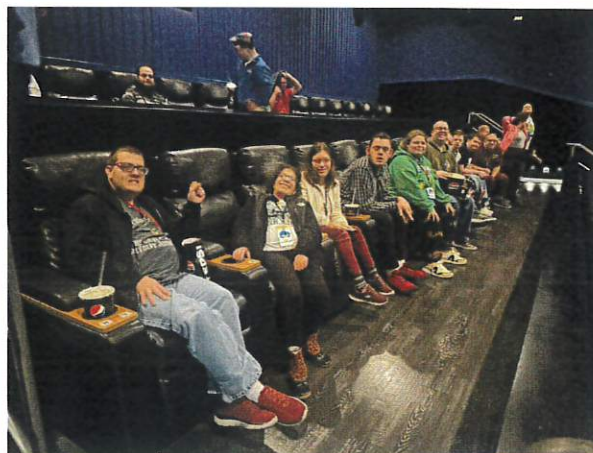
The Best Christmas Pageant Ever Movie