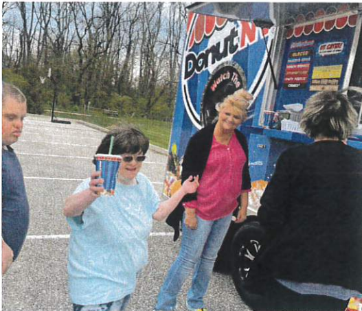
Donut NV visited us!