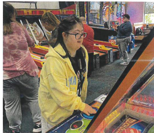
Fun at Chuck E. Cheese