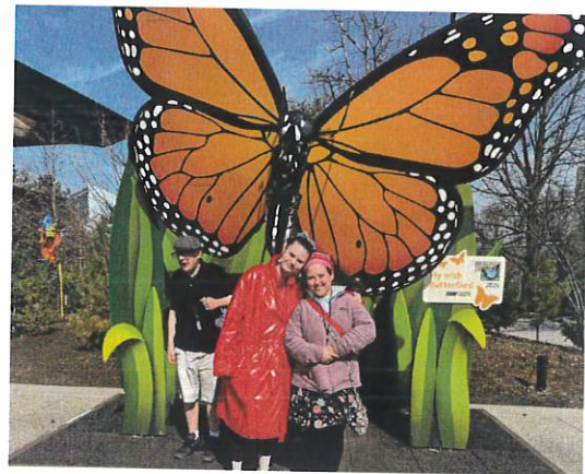
Exploring the Indianapolis Zoo