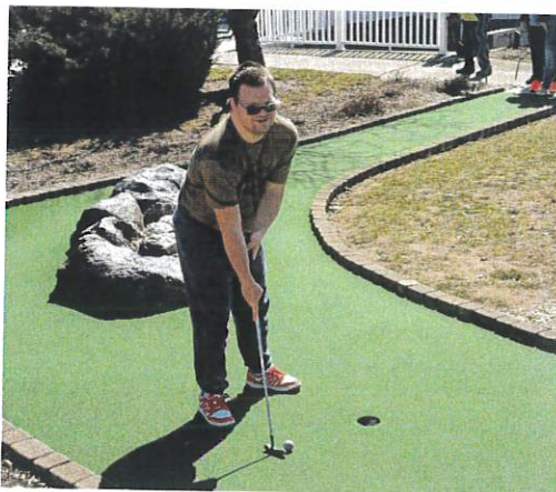
Playing a round of miniature golf