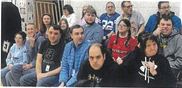
Program at Douglas McArthur Elementary