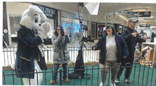
Shopping at the Mall